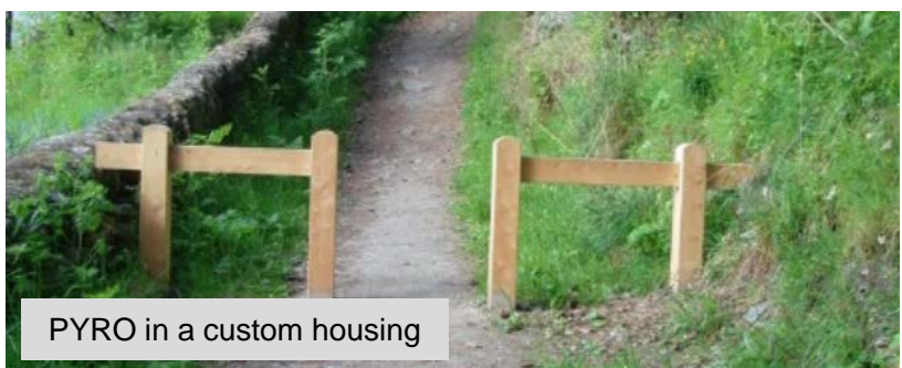
PYRO in a custom housing