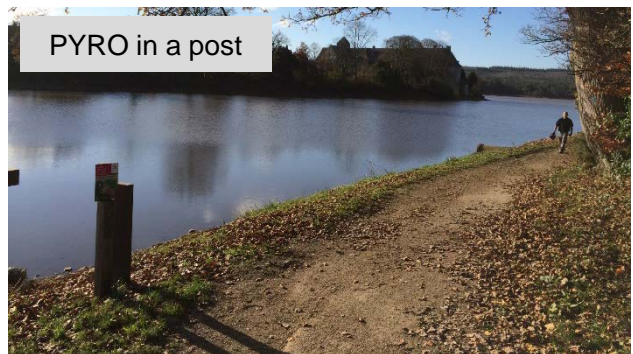
PYRO in a post