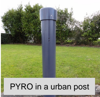
PYRO in a urban post